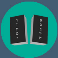
Toward a Meaningful Shavuot: Making Shavuot Relevant

Here are some hand-picked resources for you: