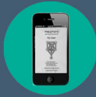
MyOmer Mobile App (iOS and Android)