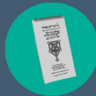
A Spiritual Guide to Counting the Omer (Book)