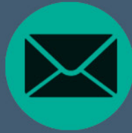
Daily Omer Email—Spiritual Guide to Counting the Omer