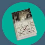
Beyond the Letter of the Law: A Chassidic Companion to the Talmud's Ethics of the Fathers (Book)