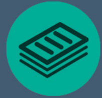
More Passover Articles and Videos